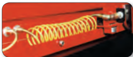
Air Line Kit Provides an air source at the front and rear for jacks and air tools.