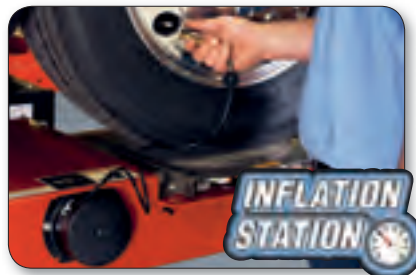
Integrated Inflation Reels (-IS models) Automatically fills or bleeds each tire.