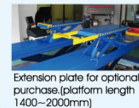
Extension plate for optional purchase.(platform length 1400~2000mm)